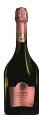
Taittinger Comtes de Champagne 2007 Rosé