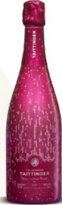
Taittinger Nocturne Rosé