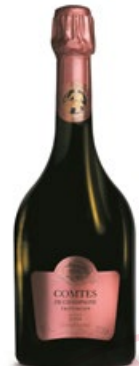
Taittinger Comtes de Champagne 2007 Rosé