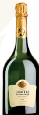
Taittinger Comtes de Champagne 2007 Blanc de Blancs