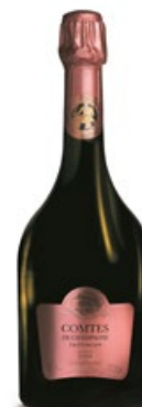
Taittinger Comtes de Champagne 2007 Rosé